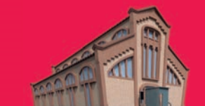
Biblioteca del Campus Universitari de Manresa (BCUM) biblioteca.upc.edu/bcum