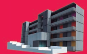
Residència Universitària www.unihabit.com